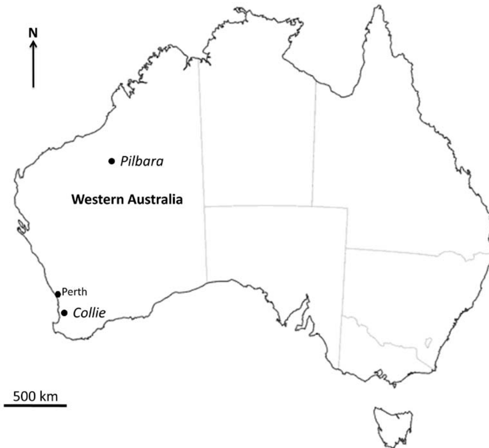
Fig. 1. Case study locations in Western Australia

Site-specific trigger values were derived following the derivation protocol presented in the flow chart (Fig. 2). This protocol is fundamentally based on Section 3.3.2 'Defining low-risk guideline trigger values' of the Australasian Water Quality Guidelines for Fresh and Marine Waters (ANZECC/ARMCANZ 2000). Outliers are measurements that are extremely large or small relative to the dataset distribution and, therefore, are suspected of being sampling errors that may misrepresent the population from which they were collected (USEPA 2006). Significant outliers were identified and removed from the datasets prior to analyses.